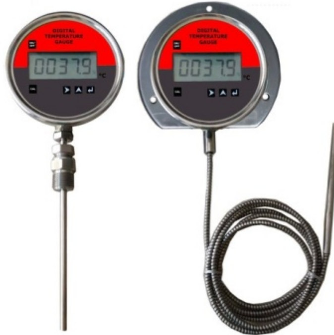
Rigid Stem Type